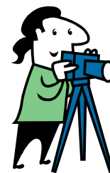
Photo proofs will be sent home once the office receives them.

Lifetouch Photography will be here on Thursday, May 10 for grade 1 and Thursday's Kinders and Friday, May 11 for Grade 2, PreK and M/W Kinders to do Spring photos.