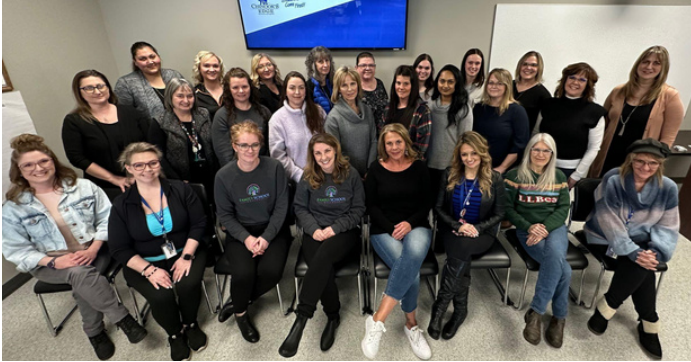
CESD Family School Wellness team